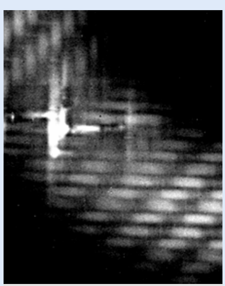
Thermographic phase image of impactgenerated cracks in CFRP

Due to the relatively low electrical conductivity of carbon the electromagnetic pene-